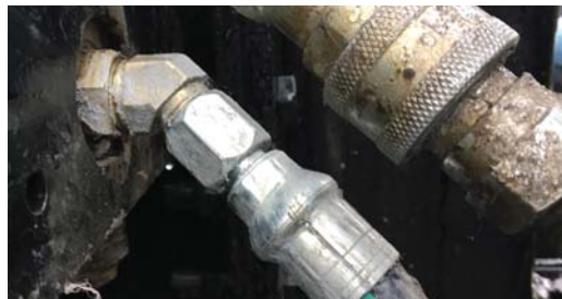
Denso ColorTape removed after 1 year (left fitting) vs one fitting (right fitting) that was not wrapped.