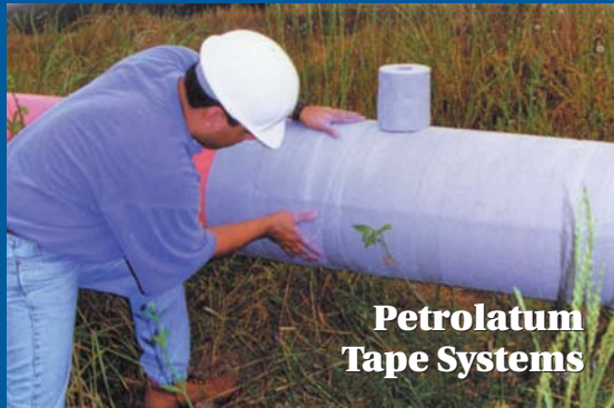
Petrolatum Tape Systems