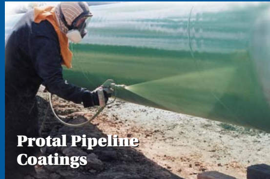
Protal Pipeline Coatings