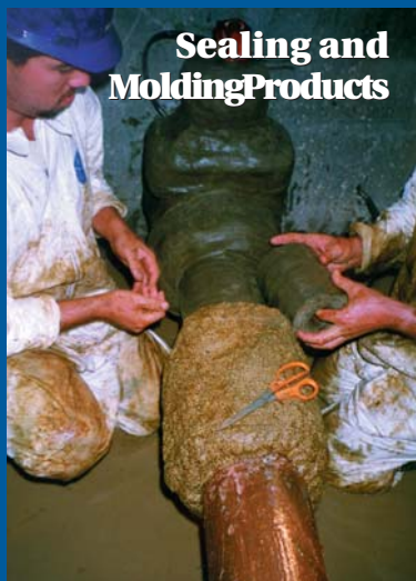
Sealing and Molding Products