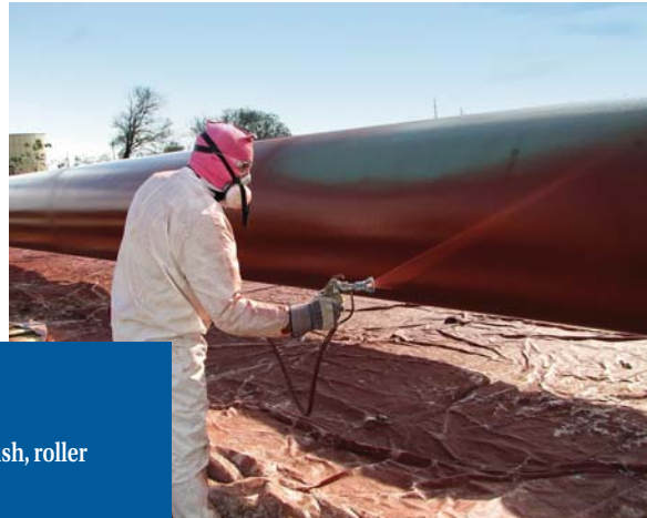
Protal ARO being sprayed applied.