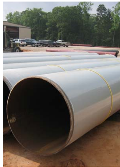
Pipe coated with 30 mils of Protal 7900HT.