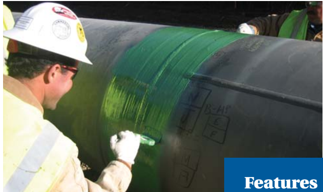
Protal 7200 being brushed applied.