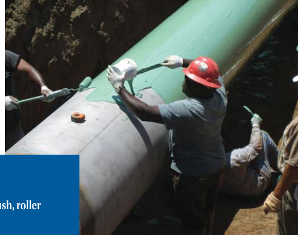
Pipeline rehab using roller application.