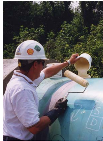
Protal being poured onto pipe.