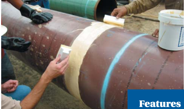
Protal applicator pad application.