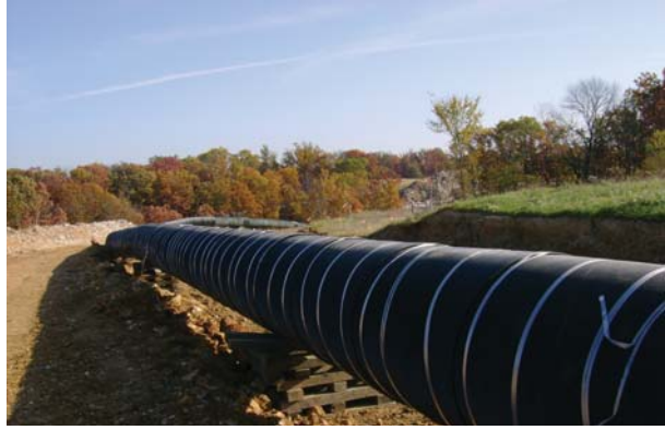
Denso Rockshield HD is essential where pipelines are constructed through rocky terrain.