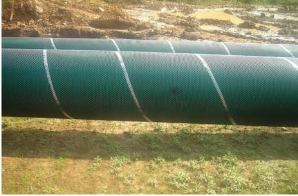
Denso Rockshield SD can be easily applied and provides additional protection.