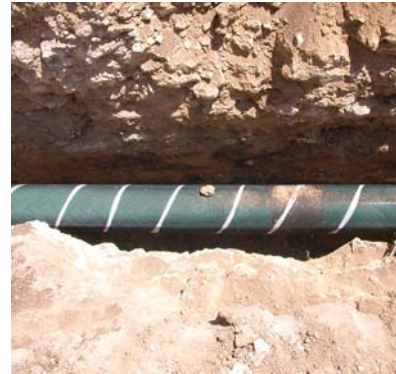
Denso Rockshield SD in action, protecting the pipe coating.