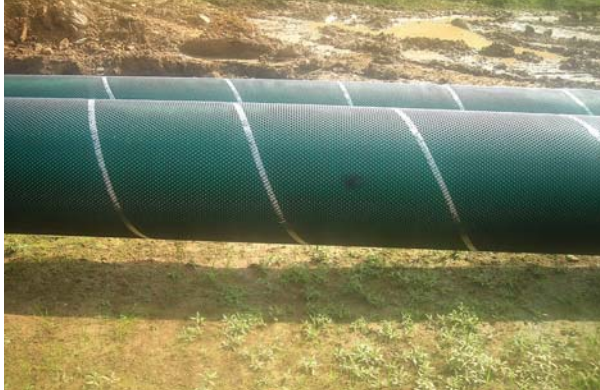
Denso Rock Shield SD can be easily applied and provides compressive strength and flexibility.