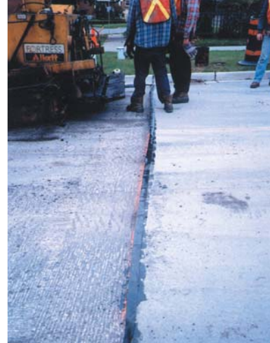
Application to asphalt/asphalt road repair.