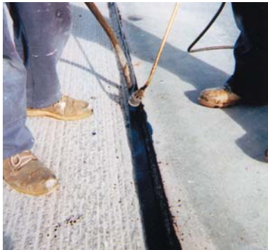
Application to asphalt/concrete airport runway.