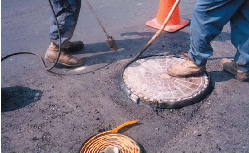
Application to asphalt/steel road structures.