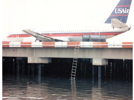
LaGuardia Airport used the SeaShield Series 100 System to provide corrosion protection for over 2,000 steel piles.