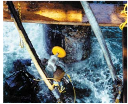
▲ The components of the Series 100 System can be applied under water with minimal surface preparation. ▼