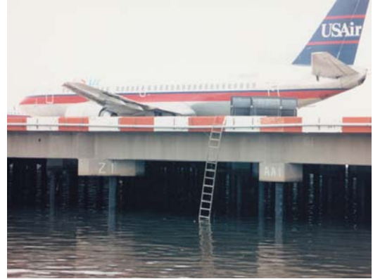
LaGuardia Airport used the SeaShield Series 100 System to provide corrosion protection for over 2,000 steel piles.