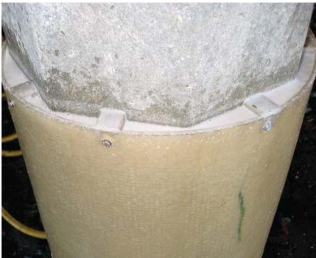
SeaShield 550 Epoxy grout pumped into the annulus around an existing octagonal concrete pile.

For further details please refer to the technical data sheets for the SeaShield Fiber-Form Jacket and SeaShield 550 Epoxy Grout.