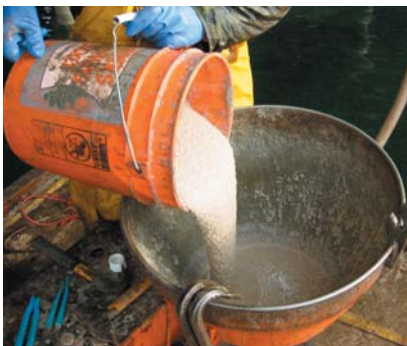
SeaShield 550 Epoxy grout being mixed and poured into pump.

The SeaShield 550 Epoxy Grout is a 3-component water displacing epoxy resin/aggregate formulation which provides a durable, well bonded repair to concrete, steel and timber piles below water. The 550 Epoxy Grout can be easily pumped into the Fiber-Form Jacket due to its excellent flowability characteristics.