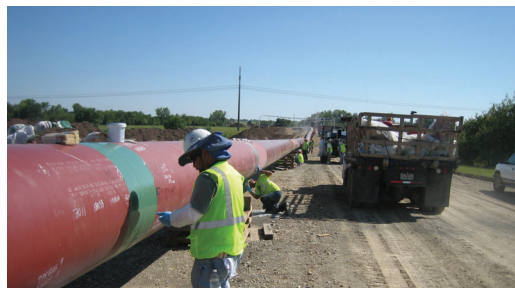
Mainline crew applying Protal™ 7200 to girth welds.