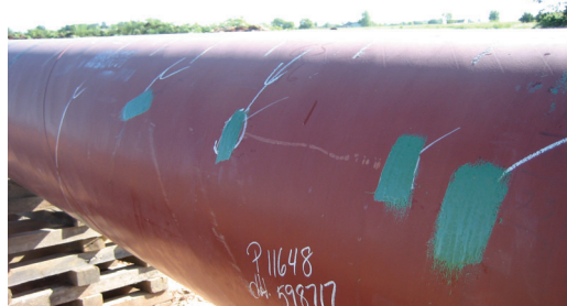
Repairing “holidays” with Protal™ 7200 Repair Cartridge.