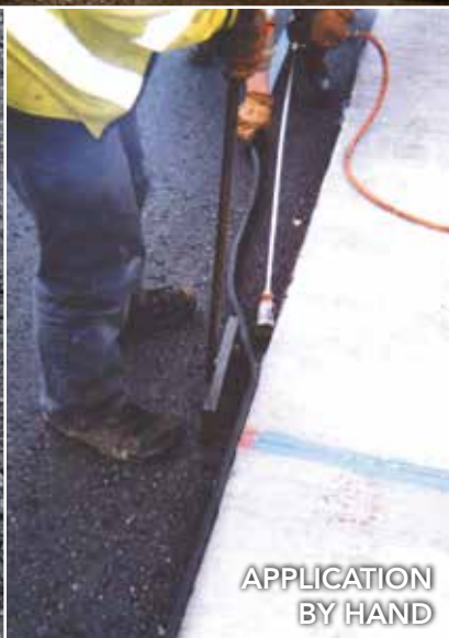
APPLICATION BY HAND