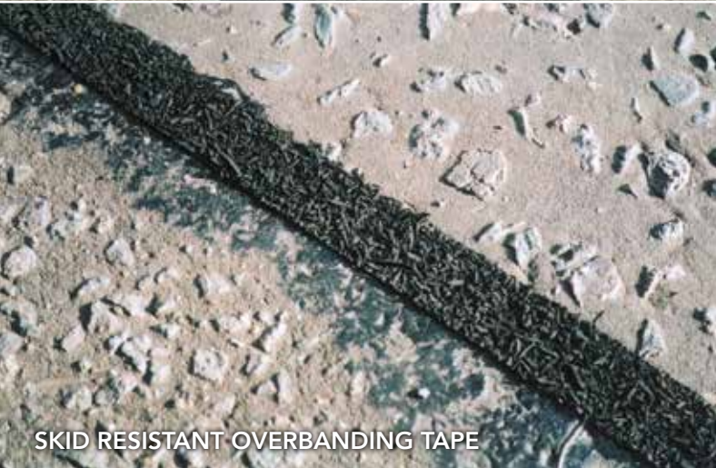
SKID RESISTANT OVERBANDING TAPE