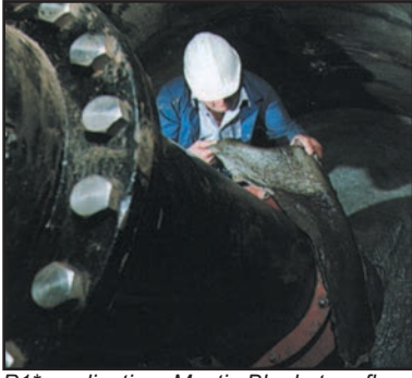
P1* application: Mastic Blanket on flange...

*Civil Engineering Specification for the Water Industry, Fourth Edition 1993