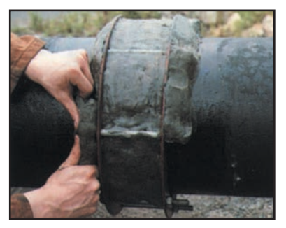
Profiling and infilling with Densyl Mastic