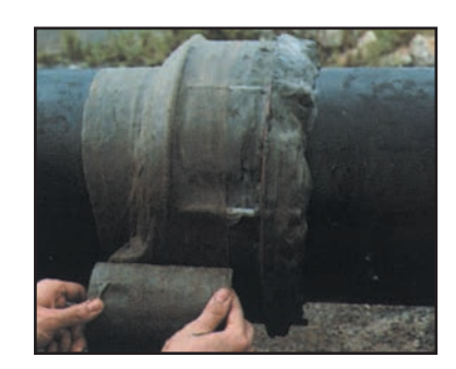
Overwrapping with Denso Tape