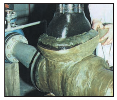
Overwrapping with Denso Tape