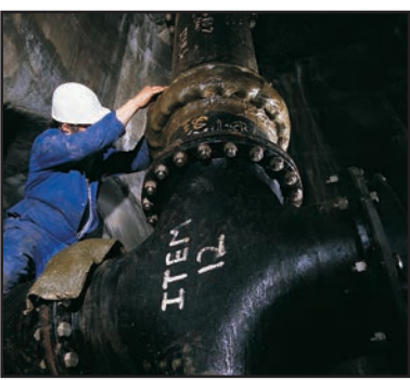
being overwrapped with Denso Tape..