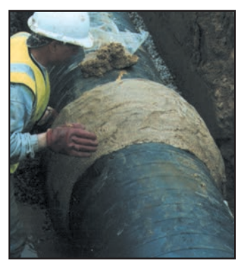
Densyl Mastic Blankets