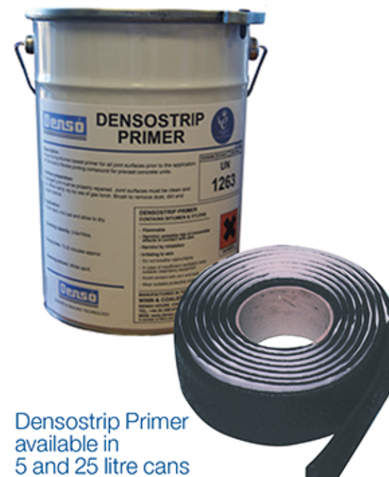
Densostrip Primer available in 5 and 25 litre cans

A cold applied preformed sealing strip based on bitumen for sealing joints between precast concrete units used for manholes, box culverts, pipes and tunnel segments.