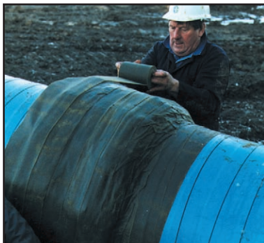
being overwrapped with Denso Tape...