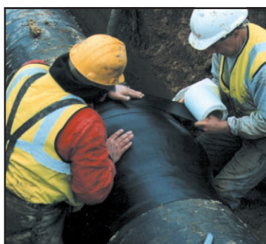
being overwrapped with Densoclad Tape...