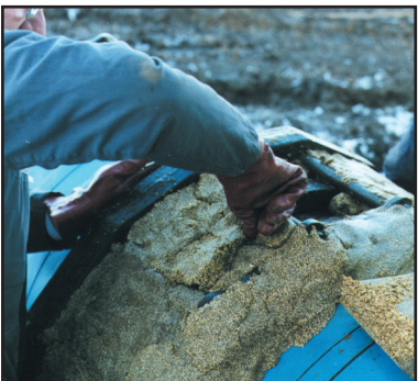
P1* application: Profiling Mastic on Tybar...