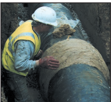
P2* application: Profiling Mastic on flange...