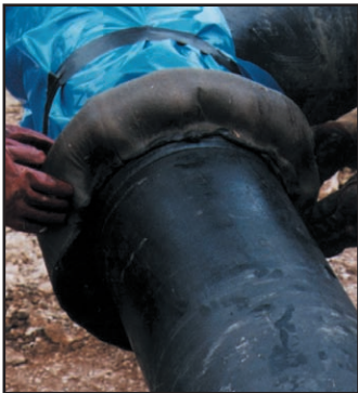
Densyl Mastic Blankets

Self-supporting and non-cracking, Denso Pipeline Mastics remain permanently plastic whilst being impervious to moisture. They are highly resistant to mineral acids, alkalis, salts and mechanical stress over a wide temperature range. These characteristics give the products great versatility. Used prior to the application of Denso or Densoclad Tape, the products are ideal for building up contours on mechanical pipe joints, valves, bolted flanged joints, etc. Should it be necessary at any time to examine, modify or repair the items so sealed, the Mastics can be easily removed and re-used if required provided the product has not been contaminated.