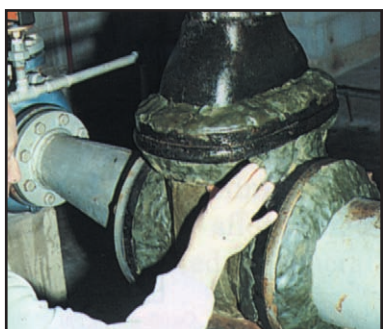
Profiling with Densyl Mastic.