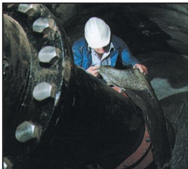
P1* application: Mastic Blanket on flange...

*Civil Engineering Specification for the Water Industry, Fourth Edition 1993