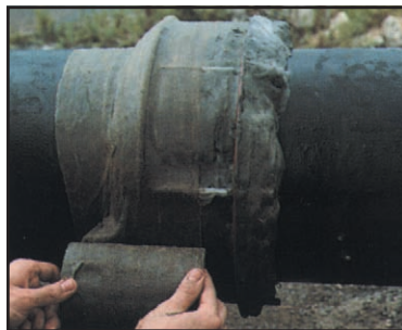
Overwrapping with Denso Tape