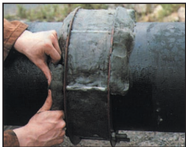
Profiling and infilling with Densyl Mastic.