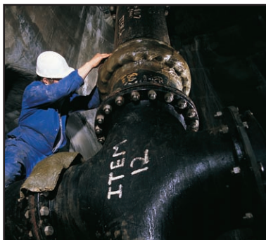
being overwrapped with Denso Tape...