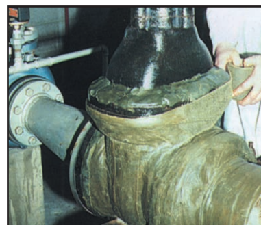
Overwrapping with Denso Tape