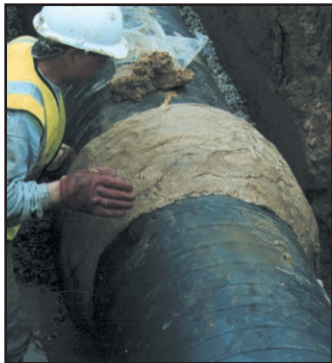
Denso Profiling Mastic.