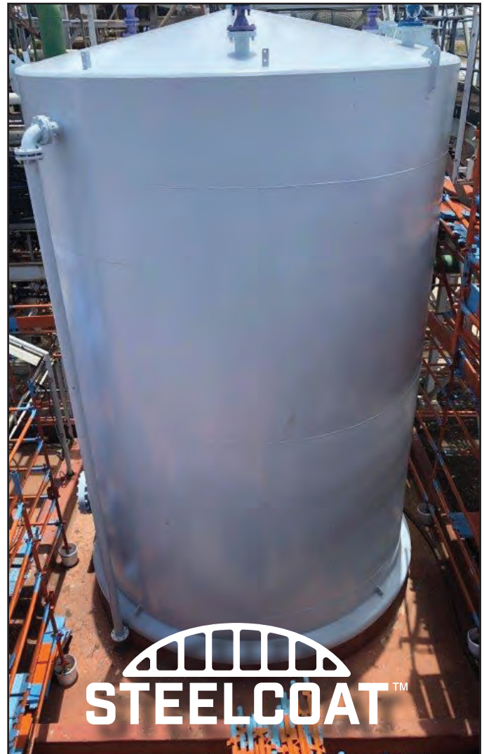
Above: Steelcoat 700™ System protecting tank and tank base.