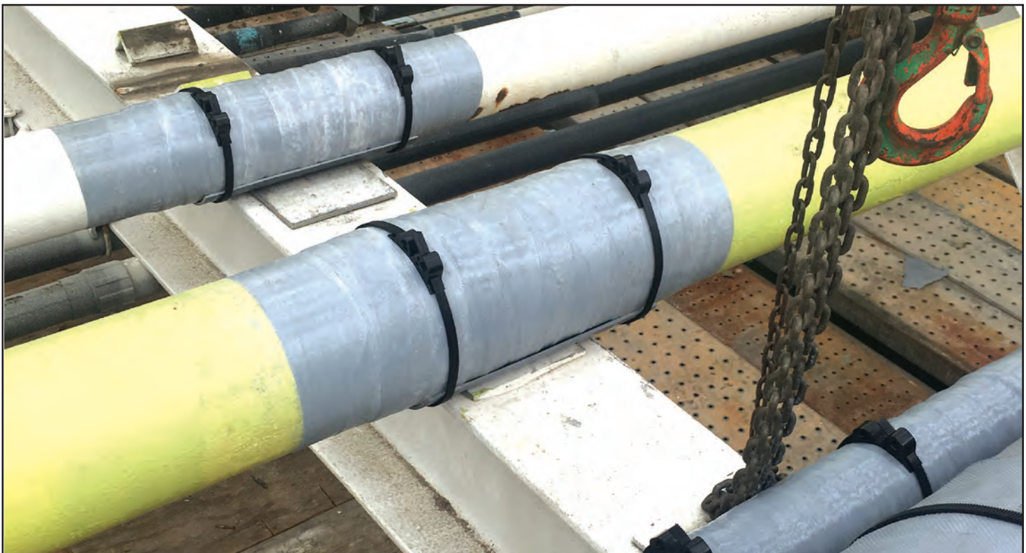
Denso ColorTape™, Denso Glass Outerwrap UV™, and Denso FRP Spacer™ held in place by strapping.

environment. The system was easily installed by hand without special equipment much to the delight of the contractor and owner. This successful project adds to the 90 plus years of case histories featuring the Denso™ Petrolatum Tape System in a wide variety of applications.