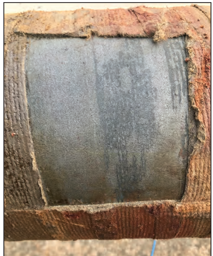
After 1 year, a field trial splashzone test with Denso™ Petrolatum Tape & Denso Glass Outerwrap™ reveals steel surface in perfect condition with no corrosion.

A large oil refinery in Corpus Christi, TX asked Denso North America for a solution to corrosion issues at dock piping supports which extend out over the water near the Gulf of Mexico. Protecting these areas was critical for extending the service life of the pipe as well as protecting the marine life in the area. Opportunity for surface preparation in sensitive areas like this one is very limited. Vibration of these pipes when ships load and unload can be surprisingly violent and easily wear off any paint system that may be present. So, it was vital the solution had to offer both corrosion and mechanical protection while requiring very little surface preparation.