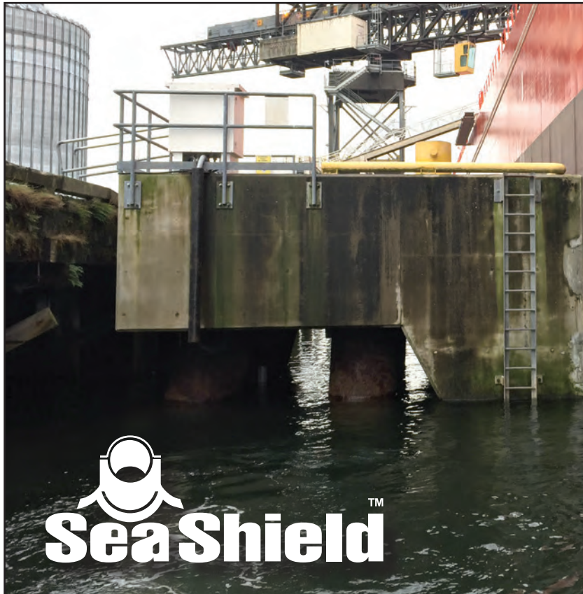
The Westview Terminal Dock.

Westview Terminal is the first purpose-built wood pellet export facility in North America. The terminal has an annual capacity to ship 1.25 million tonnes of wood pellets to world markets for use in power generation.