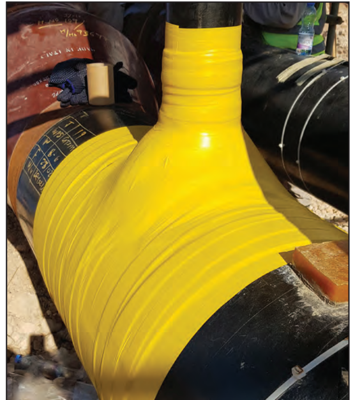
To complete the system, Denso Self-Adhesive PVC Tape™ is also applied utilising a 55% overlap.

The project which has LPG extraction facilities at Salalah Free Zone is developed by the Oman Gas Company, the pivotal company in midstream for the Oman Oil Company. The main LPG Extraction Plant will offer a processing capacity of around 8.8 million standard cubic metres per day.