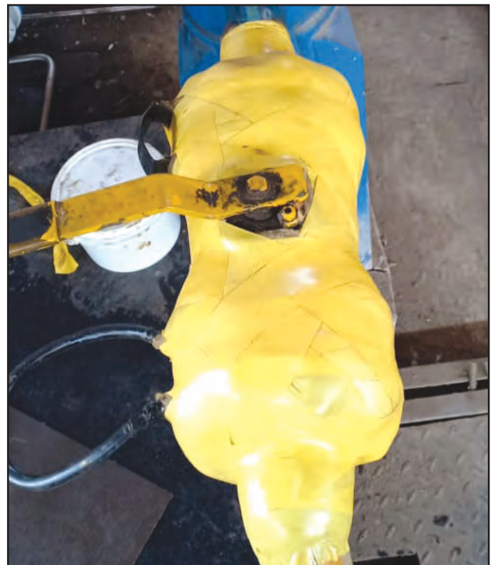
A wrap of Denso Self Adhesive PVC Tape™ completes the protection.

The Denso™ Petrolatum Tape System comprises Denso Paste™, Densyl™ Tape, Densyl Mastic™ and Denso Self-Adhesive PVC Tape™.