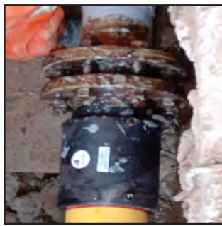
Above: A cleaned bolted flange is primed with Denso Paste™, in-situ. Below: Densyl Mastic™ is applied to fill voids and create a smooth profile on the flange before Densyl™ Tape is applied.