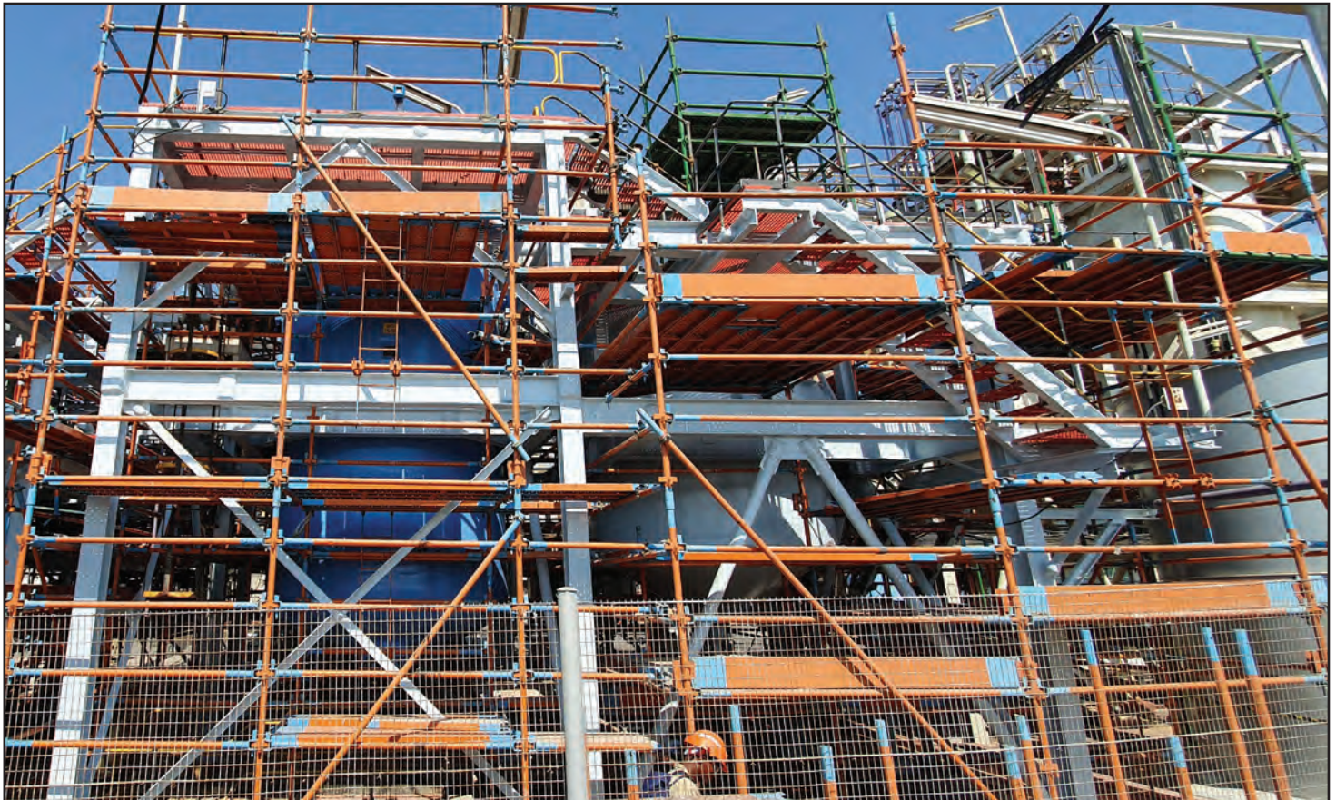
Above: The precious metals refinery in Rustenburg is subject to a highly corrosive environment.