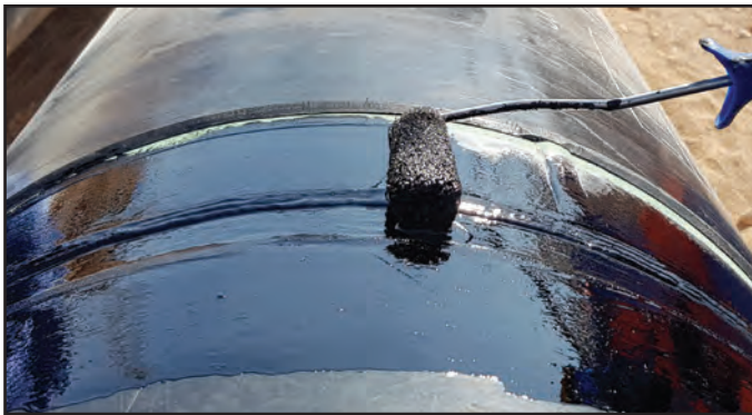
The pipe surface is primed with Denso Primer D™ and allowed to dry.

Country: Oman Object: Pipe girth weld joints, bends etc Problem: Corrosion prevention Product Solution: Densopol 60 HT™ Tape System