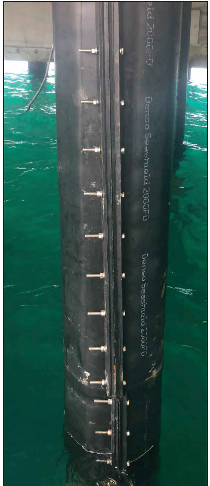
Above water close-up of a SeaShield Series 2000 FD™ protected pile.