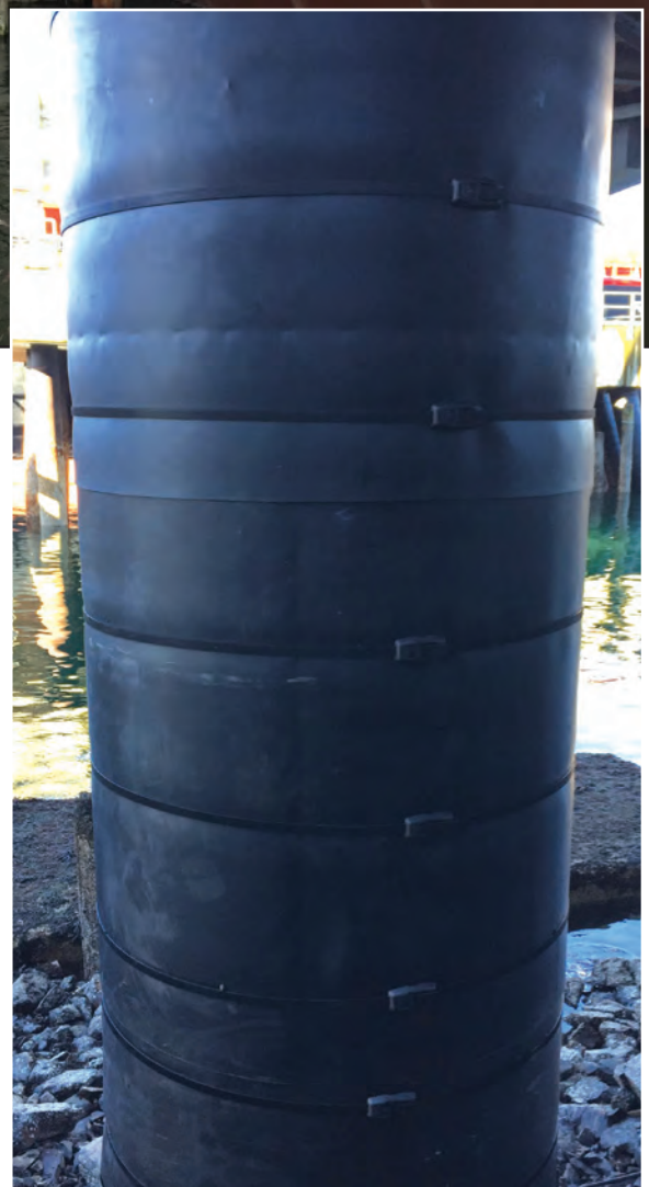
Close-up of a SeaShield Series 100™ protected pile.

Established in 1910, Prince Rupert is a port city on British Columbia's northwest coast. Prince Rupert is quickly becoming a major hub for import and export of materials to and from world markets. Pinnacle Renewable Energy owns and operates the Westview Wood Pellet Terminal in Prince Rupert.