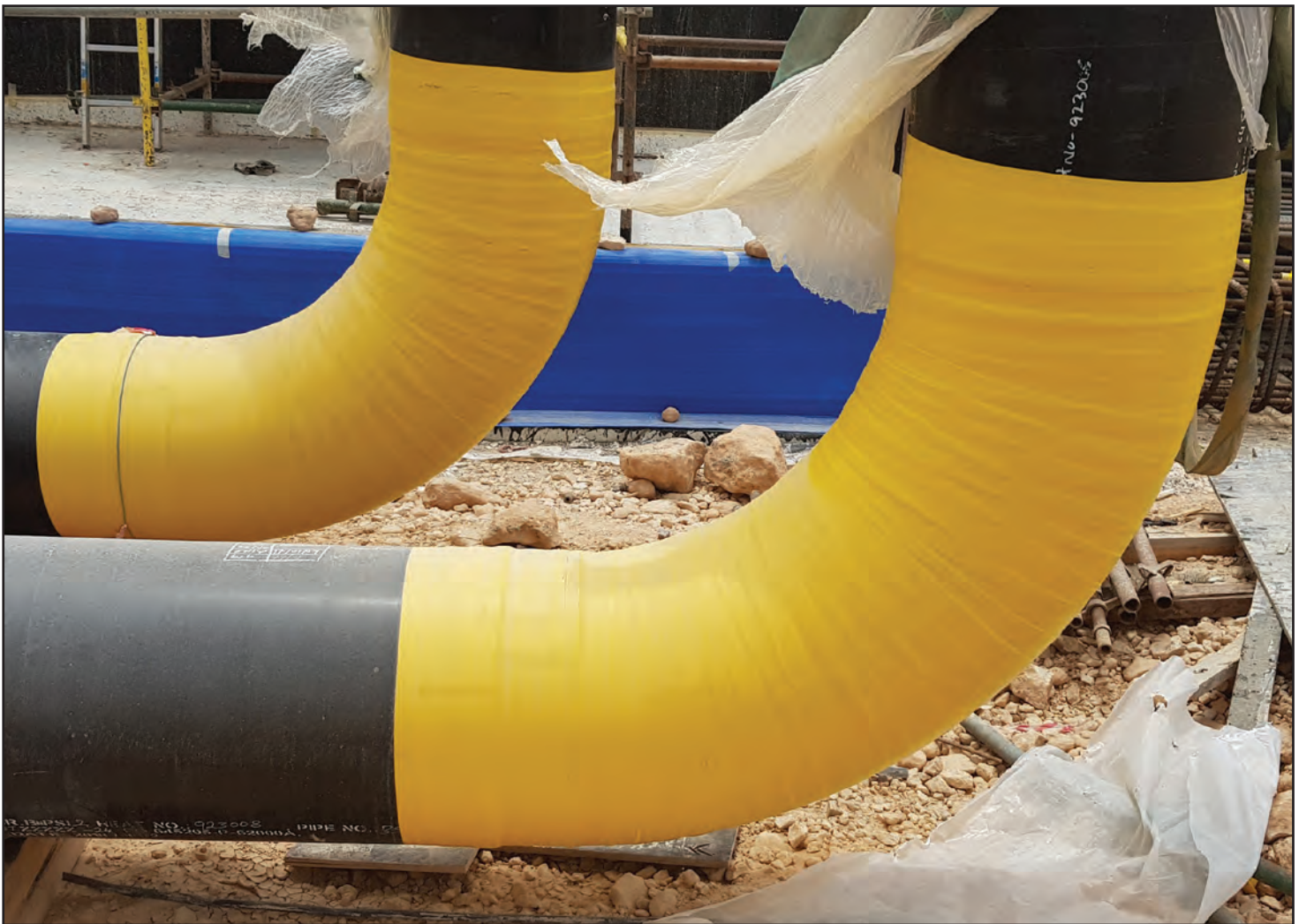
The Densopol 60 HT™ System was also used to protect pipe bends.

Winn & Coales (Denso) Ltd was chosen by the consultant and client based on their extensive successful experience in providing long-term protection for buried pipes and fittings in the region. The project involved the protection of all girth weld joints on the 3LPE and FBE coated carbon steel pipes, the pipe bends, Pipe T sections and pipe supports. Winn & Coales (Denso) Ltd are working to protect 20", 24" & 28" diameter pipe joints and bends and 28" diameter to 4" diameter reduced T branch section. A Densopol 60 HT™ Tape system was specified for this project comprising Denso Primer D™, Densyl Mastic™ & Densopol 60 HT™ Tape and Denso Self-Adhesive PVC Tape™ – Applied spirally with a 55% overlap.