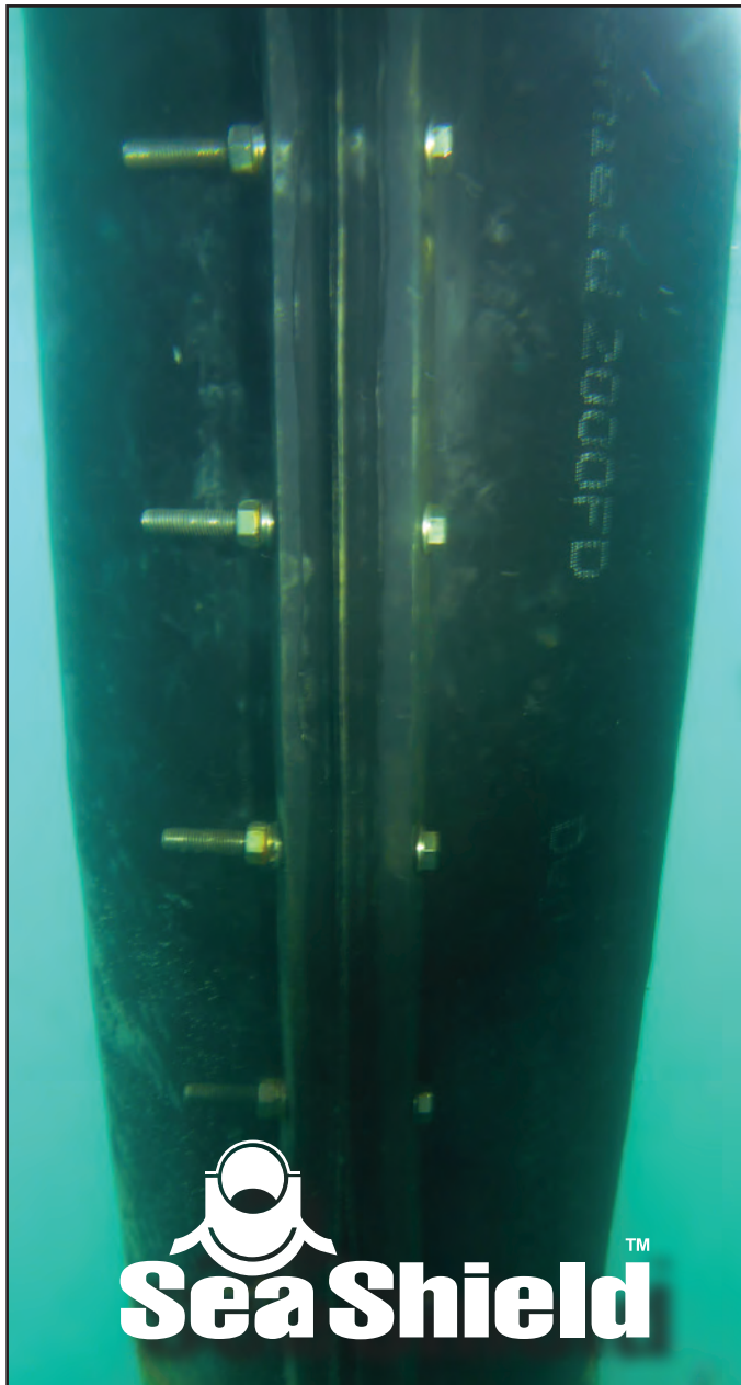
Underwater close-up of a SeaShield Series 2000 FD™ protected pile.

Professional Diving Services subcontracted Water Jet Technologies, an experienced Victorian high-pressure water blasting company, to clean the piles and ensure that they were free of existing marine growth and mill scale. Following a professional clean the HP2 piles were coated in SeaShield Primer, fitted with a Flex PVC filler to profile the 'clutch' area and allow the jacket to sit uniformly around the pile. The piles were then spirally wrapped in Denso Marine Piling Tape™ and the HDPE jacket fitted and hydraulically tensioned around the pile. The client was very pleased with the finished product which will ensure the longevity of their asset for future port operations.