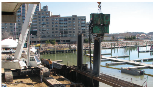
Driving the new Rigspray coated sheet piles.