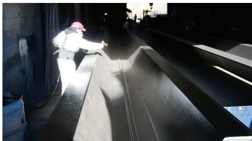
Spraying Denso Rigspray to sheet pile.