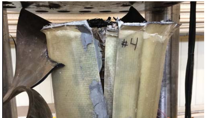
Timber piles installed with the SeaShield Series 400 System were able to withstand a maximum compressive pressure up to 466.6 kips.