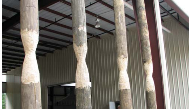
Simulated timber pile hourglass deterioration prior to having the SeaShield Series 400 System installed.