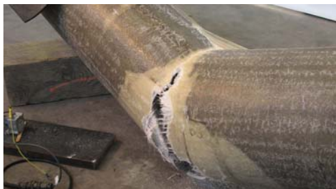
Completed bending test – all piles doubled in strength compared to the original unprotected piles.