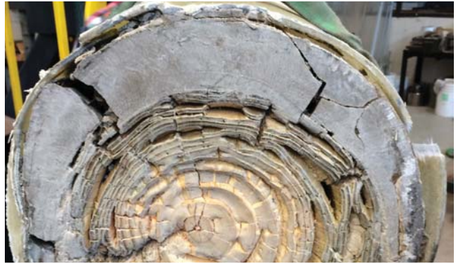
All specimens withstood 3 to 4 times the failure load of the baseline control specimen.