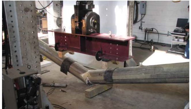
SeaShield Series 400 System at least doubles the maximum load than an undamaged, unprotected timber pile.