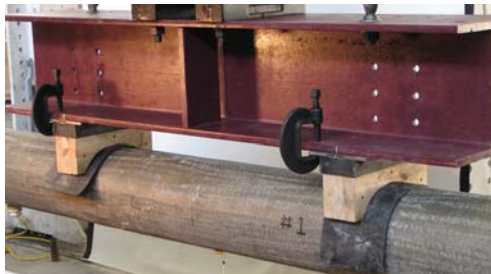
Bending test setup & actuator for the SeaShield Series 400.