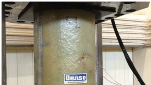
Compressive test setup.