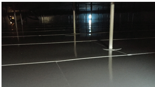
Finished Archco™ 400/400HB tank lining.