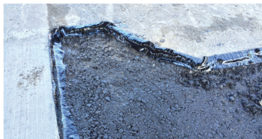
The Reinstatement Tape contours irregular shaped joints and is applied to asphalt, steel and concrete.