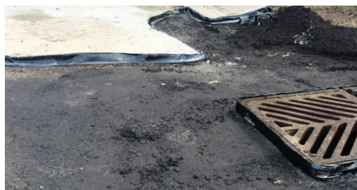
Applied in minutes to minimally prepared surfaces.