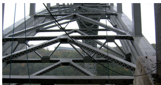
Denso Void Filler protecting stranded cable supports from corrosion.