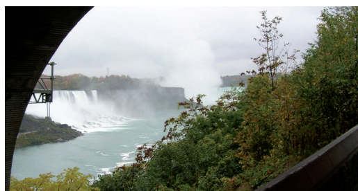
View of Niagara Falls.