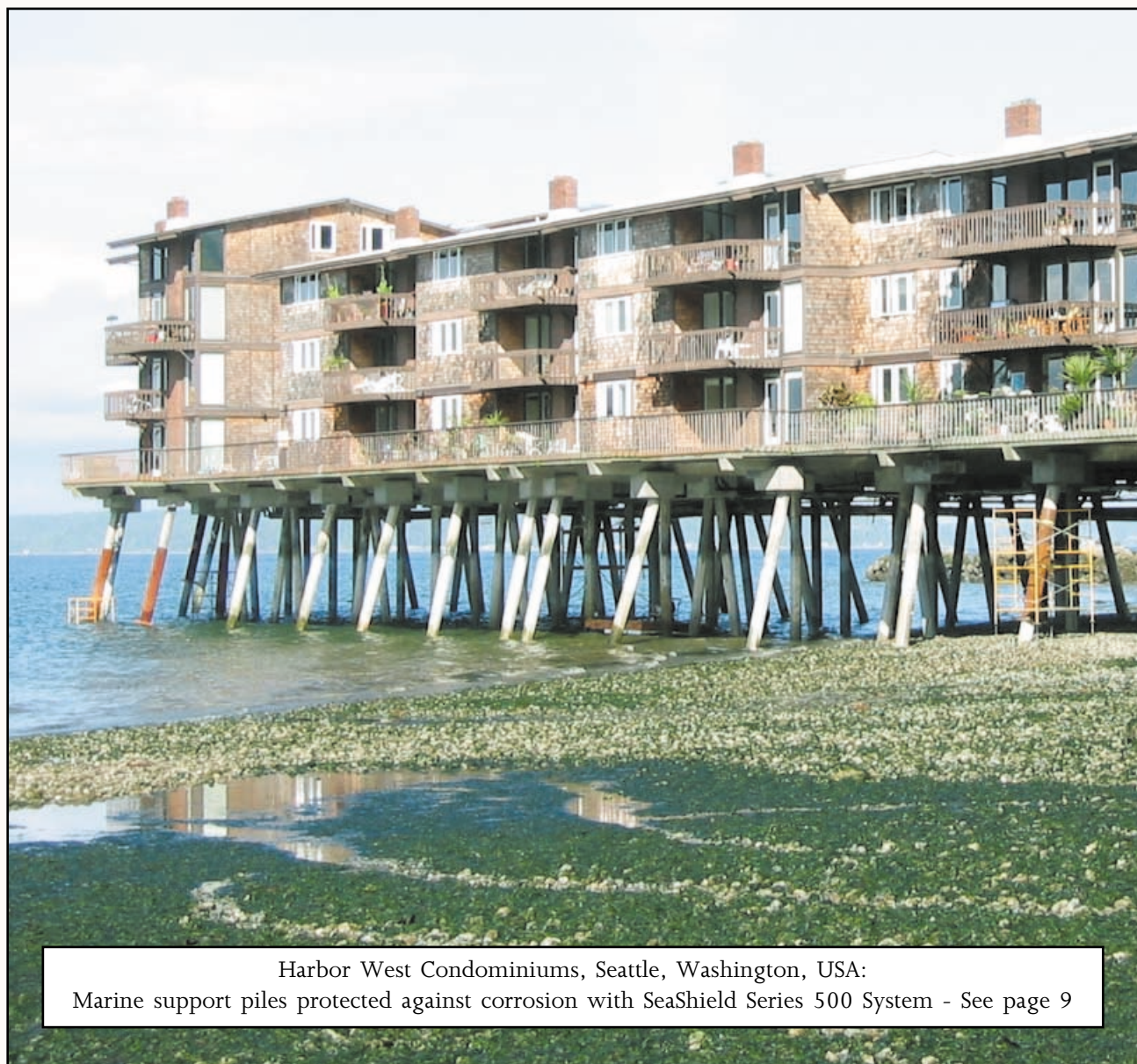
Harbor West Condominiums, Seattle, Washington, USA: Marine support piles protected against corrosion with SeaShield Series 500 System - See page 9

QUALITY & INNOVATION FROM 1883 INTO THE 21 ST CENTURY