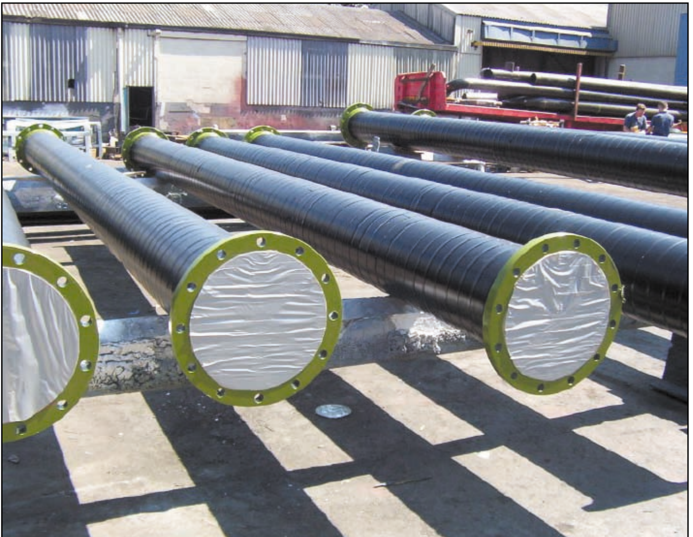
Water pipes wrapped and ready for installation.

Densoclad 70 Tape is based on a polymer modified bitumen adhesive laminated to a robust pvc backing tape, which also makes it particularly suitable for rolling rig applications when required.