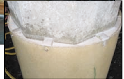
Above: Standoffs provide a minimum ½" annulus to all eight corners of octagonal piles.

the late summer and early fall when tides are difficult, temperatures are near freezing at times, and coastal waters are at their most aggressive. With all the elements working against the Contractor, they were still able to complete the project on schedule and on budget.