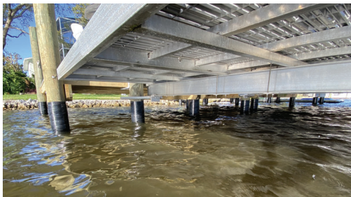
Prevents infestation of marine borers.