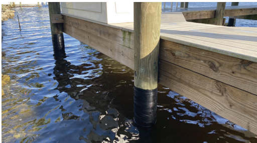
Simple design allows for easy installation.